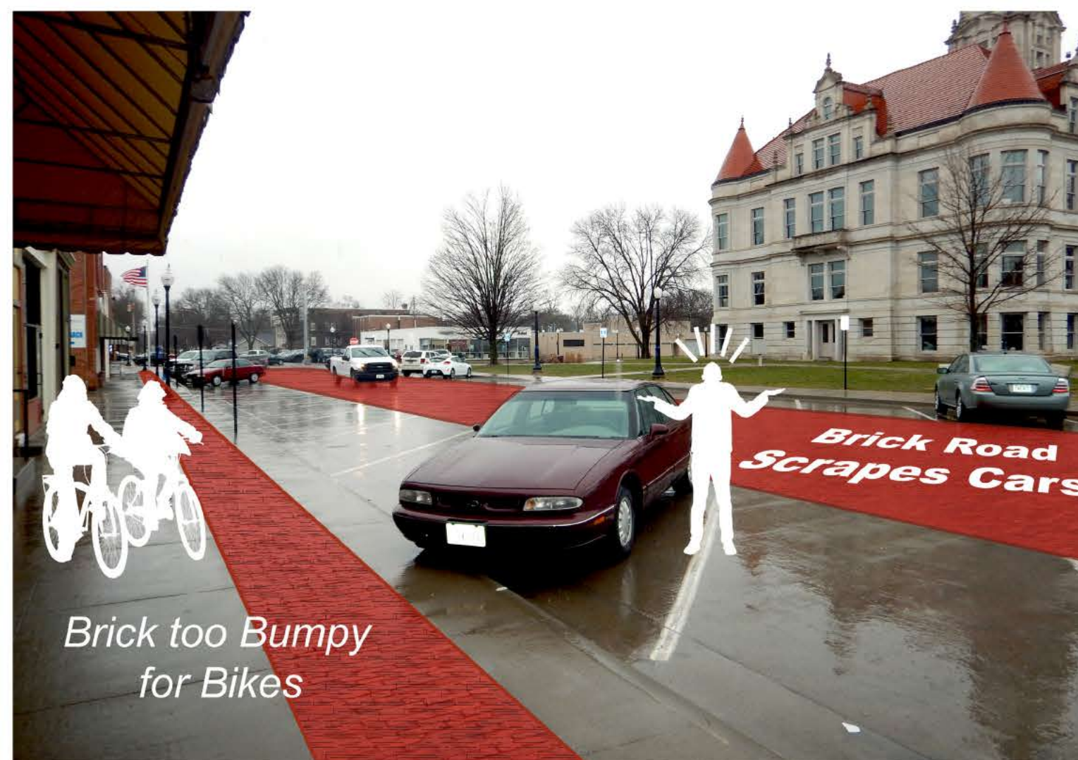
Barrier: Historical Brick Roads

Transportation is integral to small-town life and a vibrant economy. In the context of the Community Visioning Program, we recognize walking, biking, and driving as quintessential modes of travel to various destinations important to residents and visitors. Access to these destinations is crucial for many everyday activities—getting to work and school, participating in community events, and providing for basic needs such as food, health care, and healthy activity.