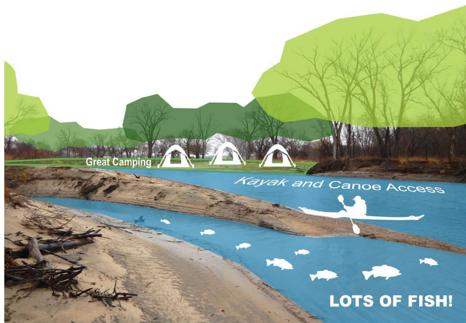
Asset: Island Park