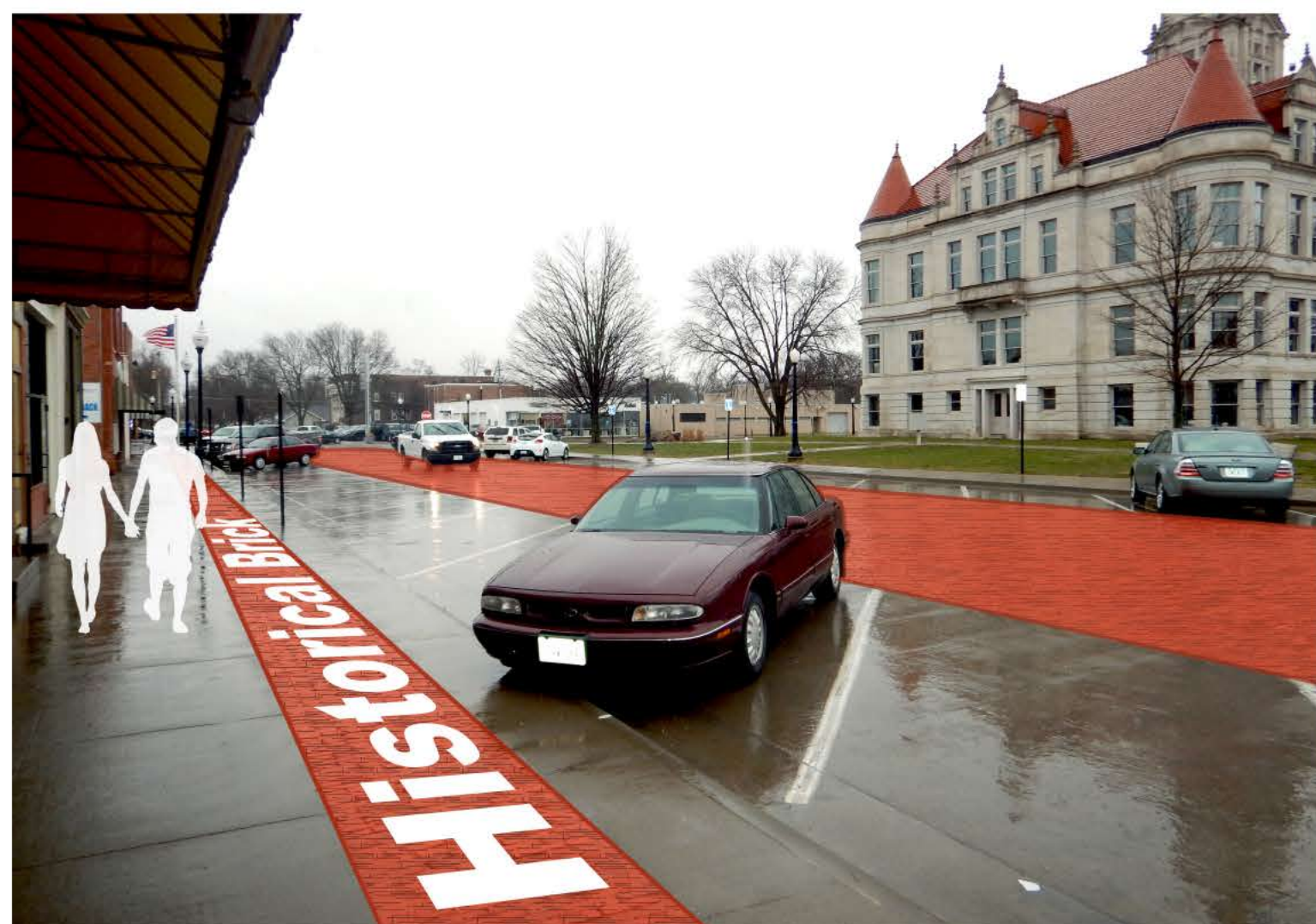
Asset: Historical Brick Roads