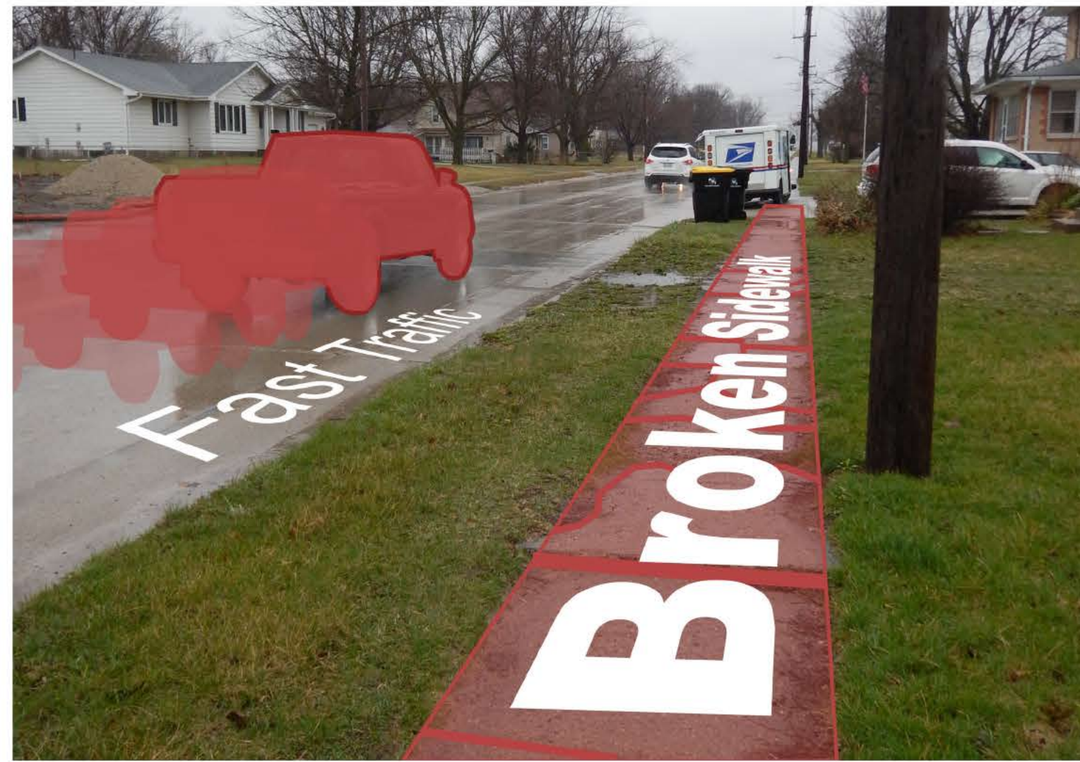
Barrier: Broken Sidewalks along 6th Street