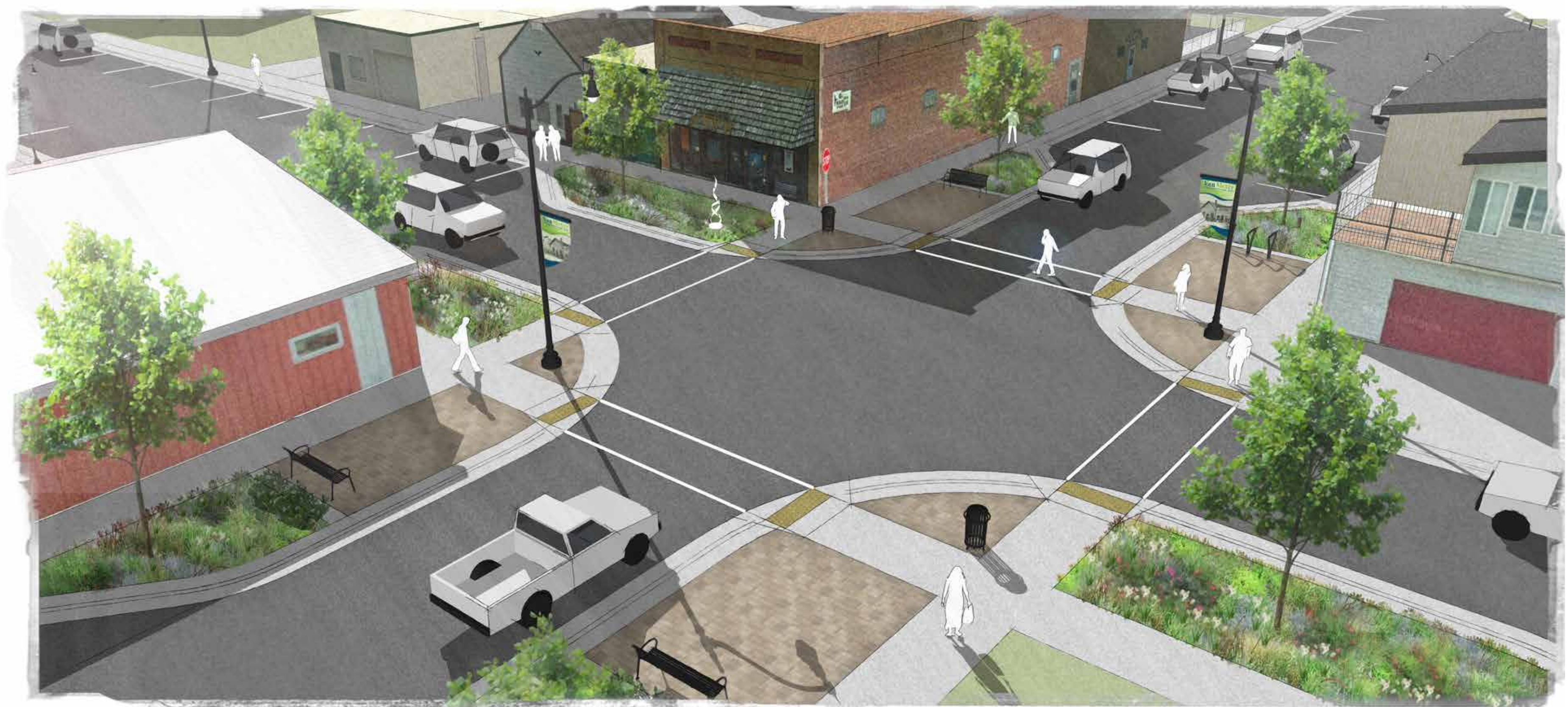
Visualization of proposed downtown improvements

Community assessments and surveys confirmed a desire to enhance the downtown streetscape, add supportive features for pedestrians, and improve walkability. Updating the streetscape to include bump-outs allows the space for amenities such as street trees, planting beds, pavers, benches, and lighting while maintaining the majority of the existing parallel parking spaces. The concept plan also considers eventual growth and redevelopment of key downtown areas. These downtown enhancements will help create a more functional and enjoyable experience for both pedestrians and motorists.