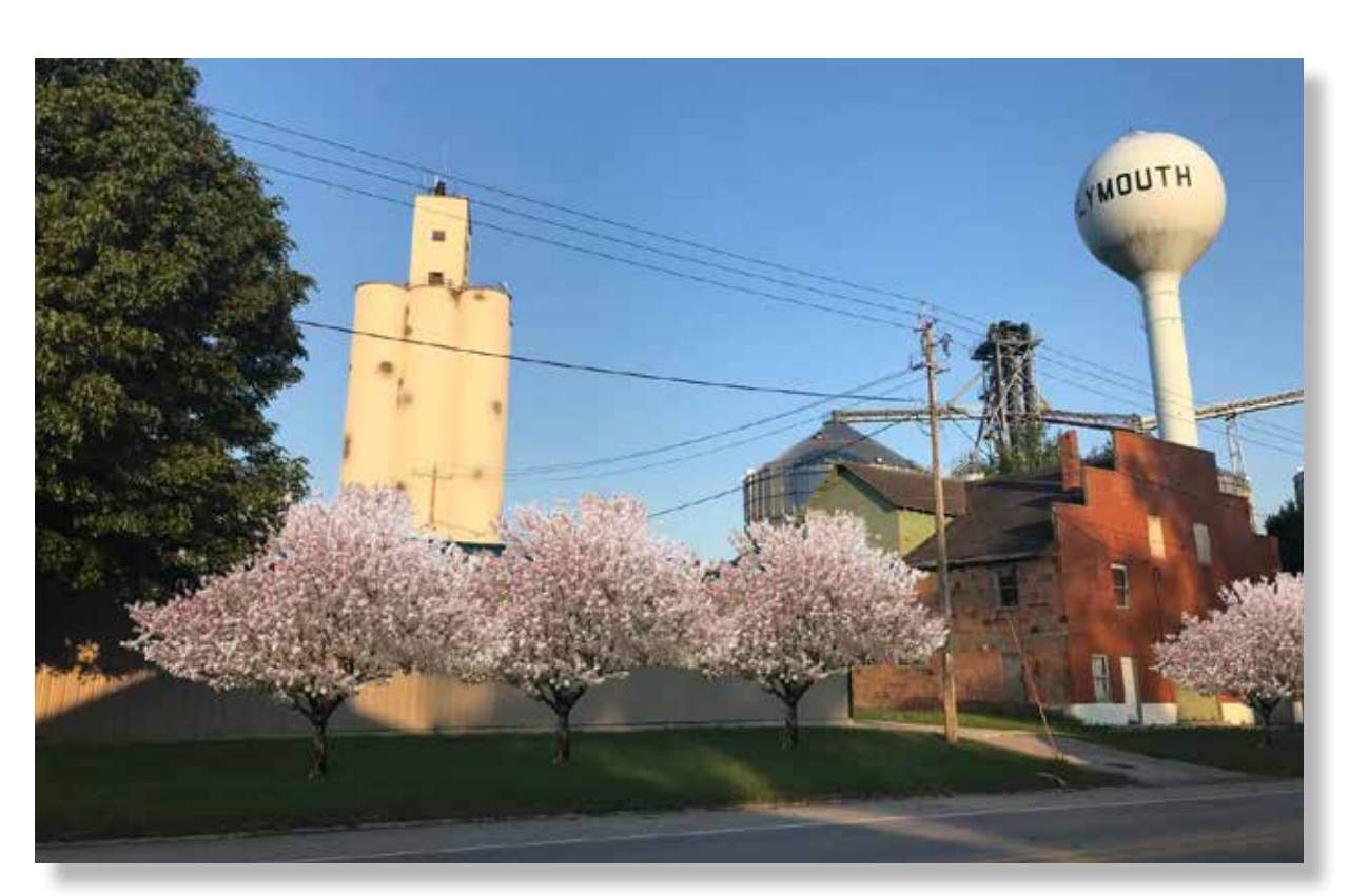
Proposed ornamental tree plantings under the power lines along County Road S56